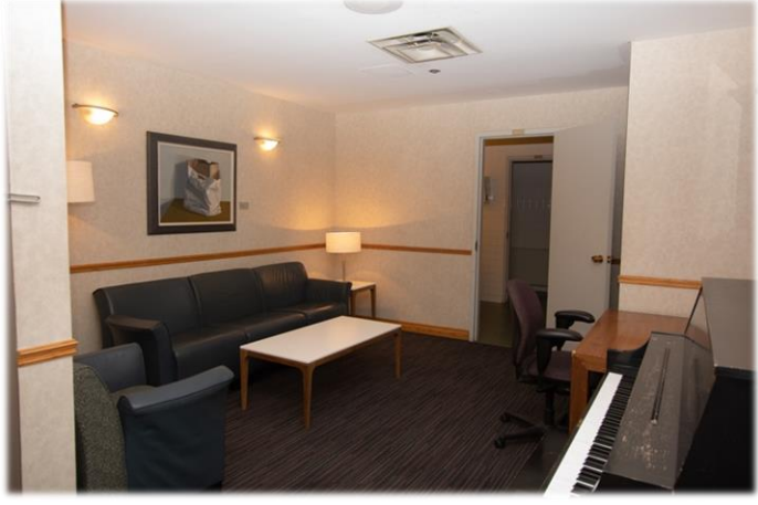
Two 3-room suites comprised of a sitting room, dressing room, and bathroom. c/w couch, easy chairs, coffee table, table & chairs, upright piano, phone lines and internet.